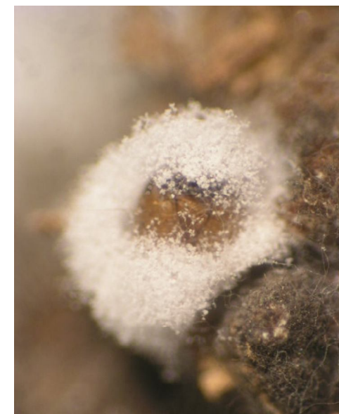
Pupa parasitada por fungo entomopatogénico ( Beauveria bassiana )