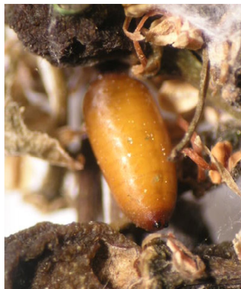
Pupa de díptero taquinídeo